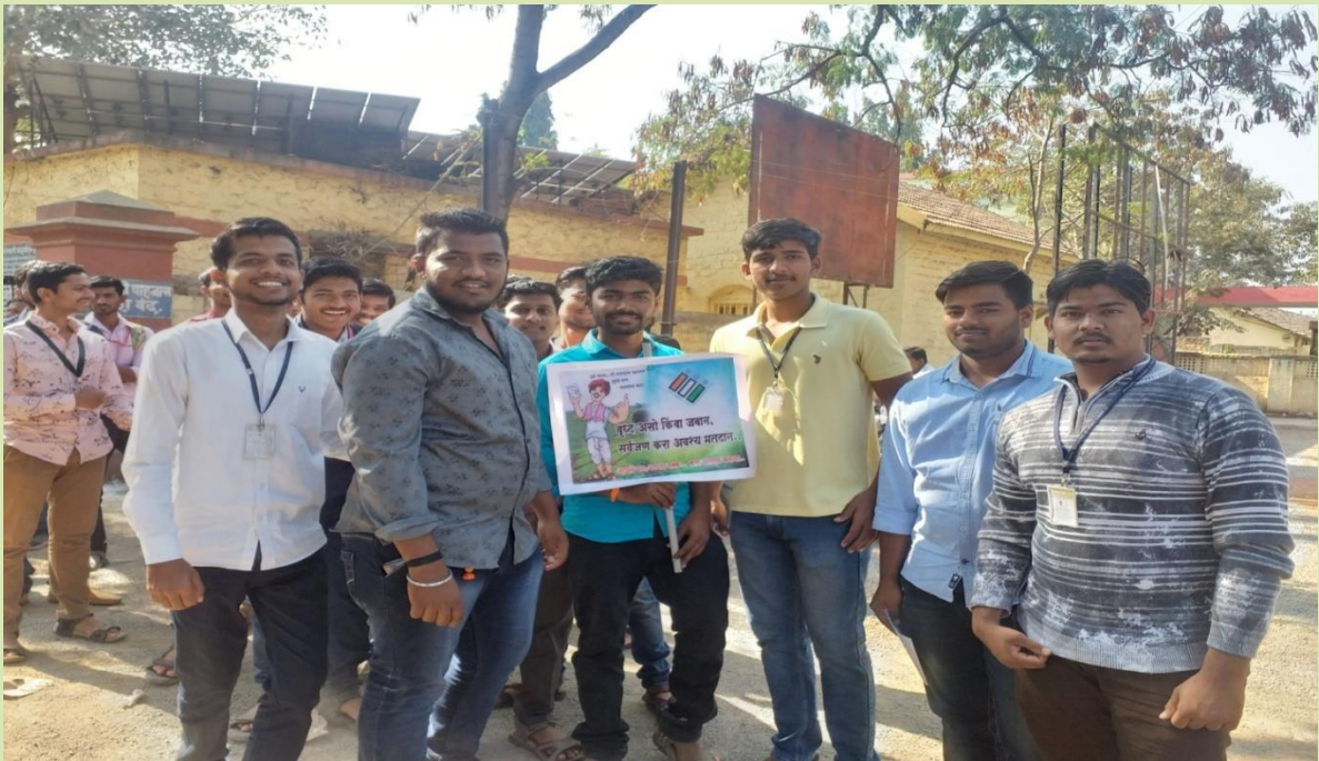
Voters awareness Rally at Pandharpur

DON'T EVER THINK YOU CAN'T MAKE A DIFFERENCE, YOU CAN!