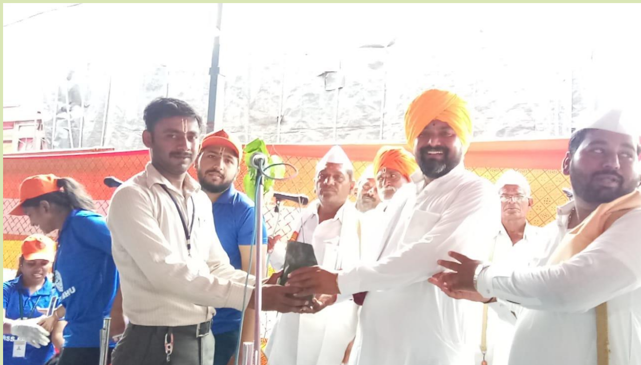
Tree Plantation In Ashadhi Wari 2019