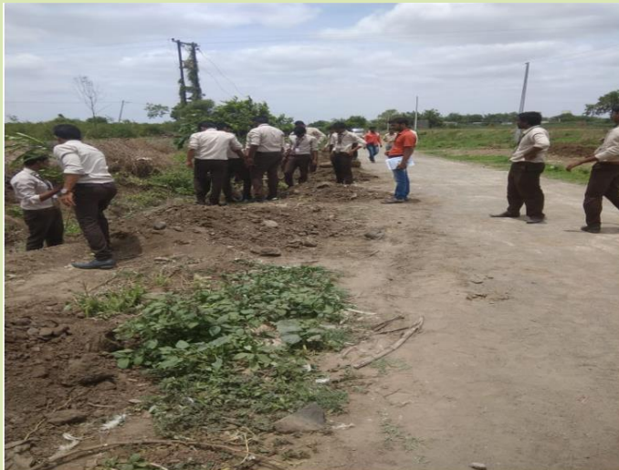
Cleaning activity Mahadev Temple at Ozewadi Gram Panchayat

DON'T EVER THINK YOU CAN'T MAKE A DIFFERENCE, YOU CAN!