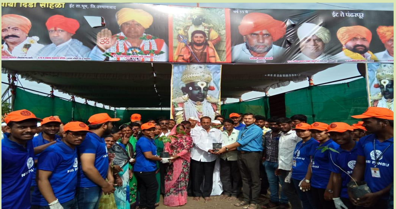
Tree Distribution during Ashadhi Wari

DON'T EVER THINK YOU CAN'T MAKE A DIFFERENCE, YOU CAN!