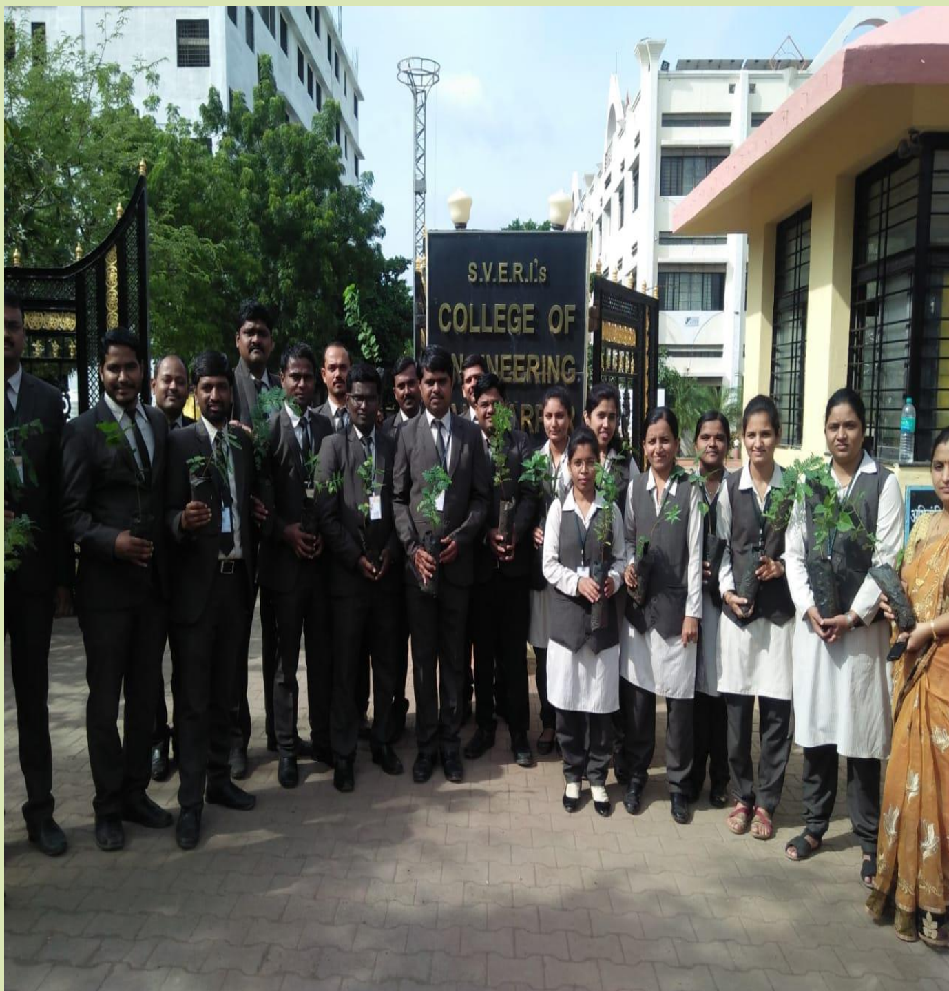
Faculty Tree Plantation

DON'T EVER THINK YOU CAN'T MAKE A DIFFERENCE, YOU CAN!