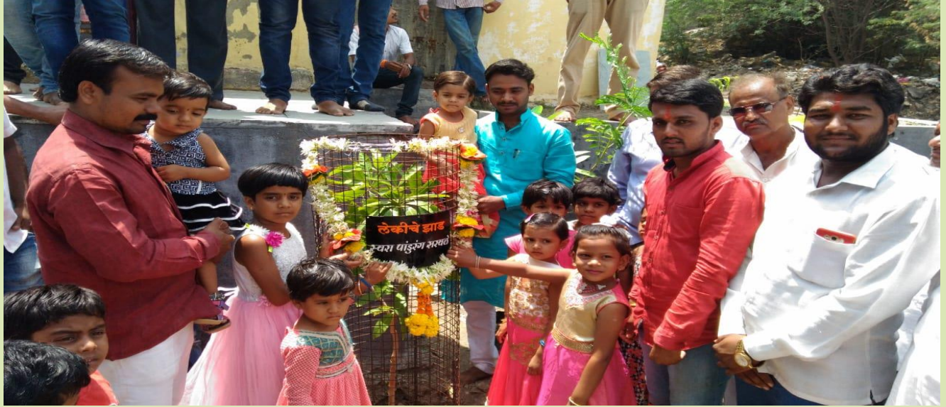
Plantation at Ghodeswar Tal. Mohol through small Girls.