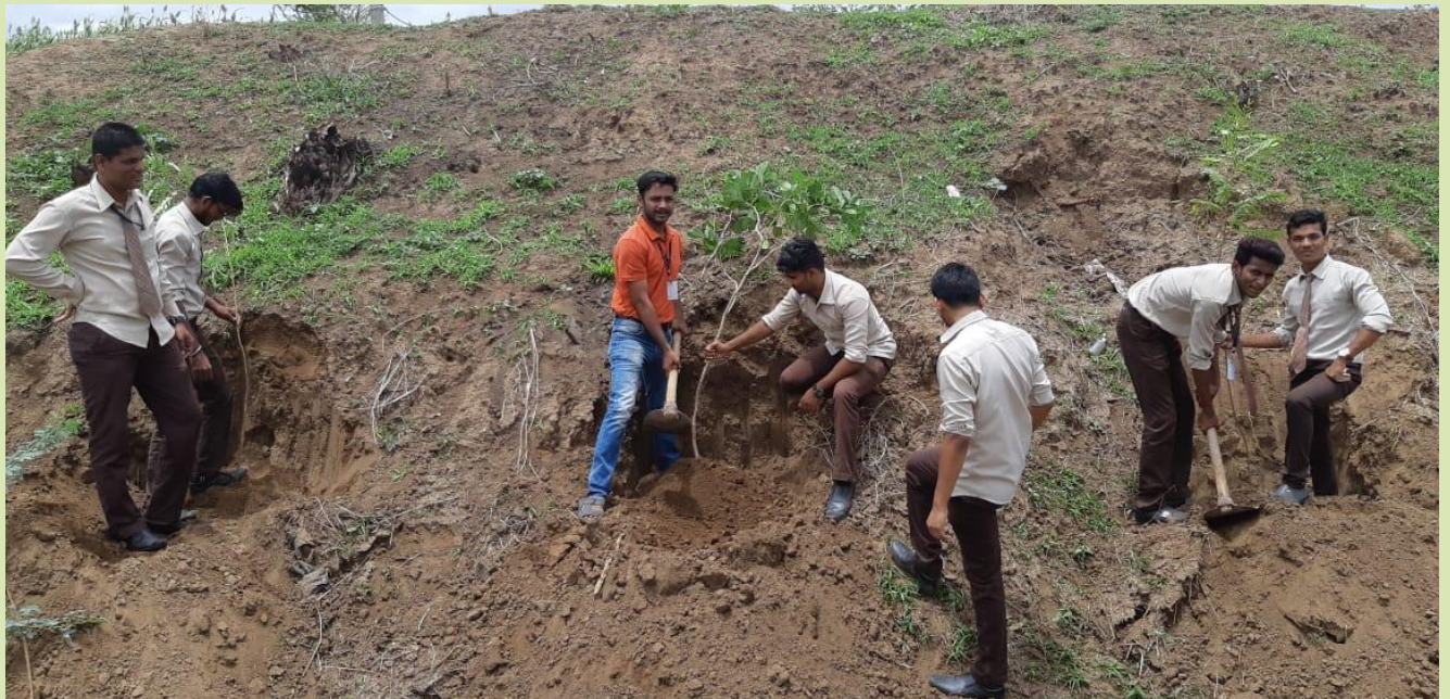
Tree Plantation at Tawashi Tal. Pandharpur

DON'T EVER THINK YOU CAN'T MAKE A DIFFERENCE, YOU CAN!