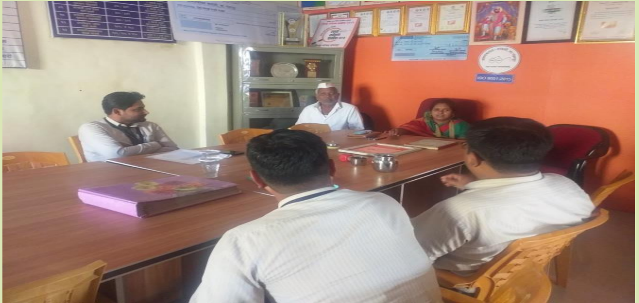
Faculty Visit at Tawashi Village