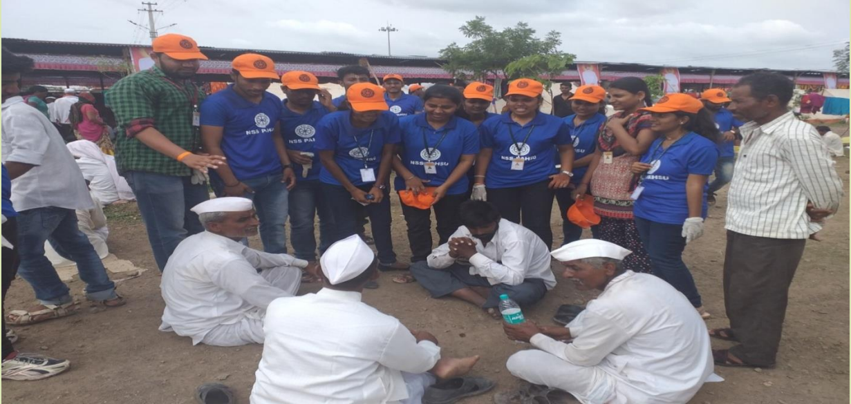
Nirmal Wari Swaccha Wari