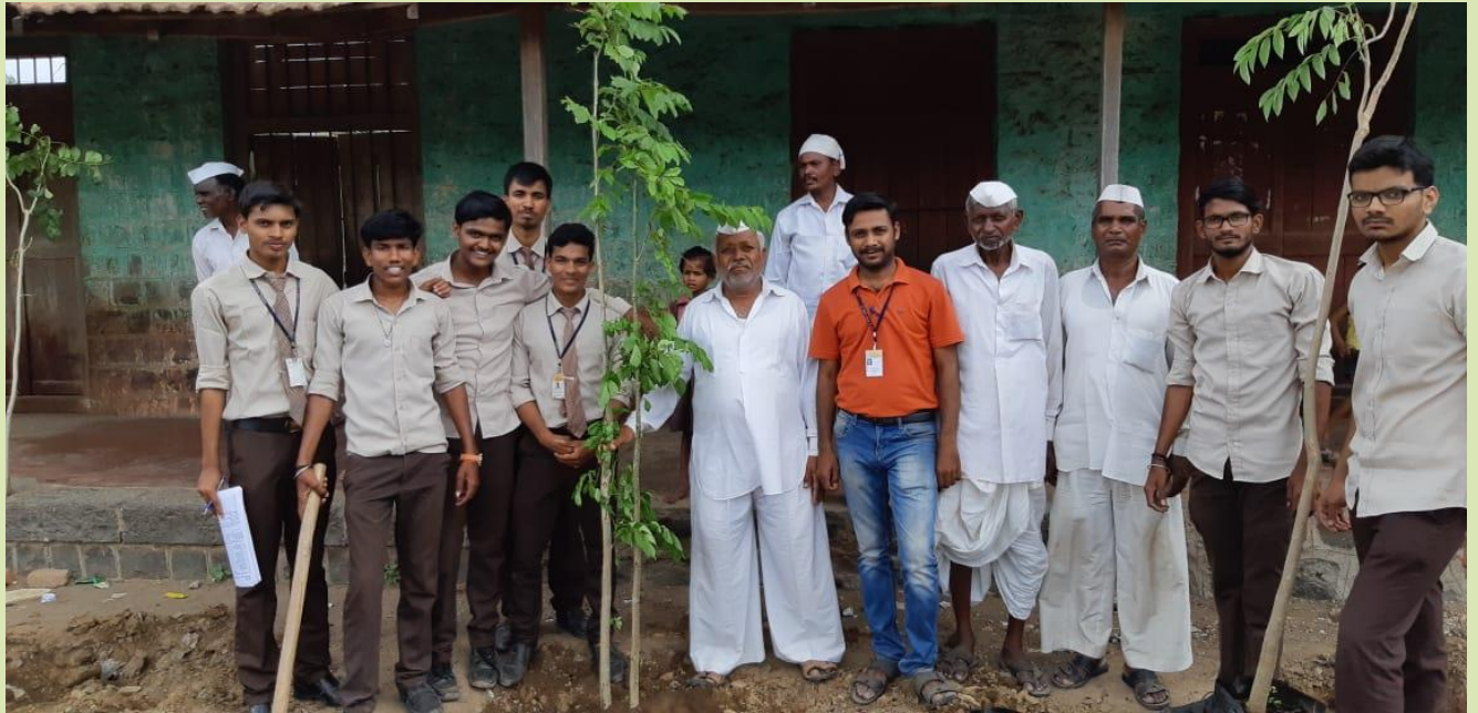
Tree Plantation at Tawashi Tal. Pandharpur