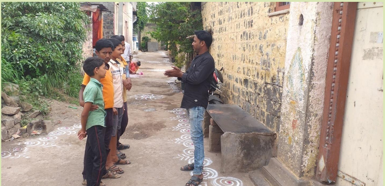
Creating Awareness about Cleaning to small children's at Ozewadi

DON'T EVER THINK YOU CAN'T MAKE A DIFFERENCE, YOU CAN!