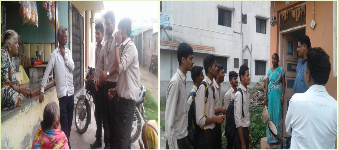
Home to Home Counseling No to Use Plastic and Cleanliness at Ozewadi Gram Panchayat