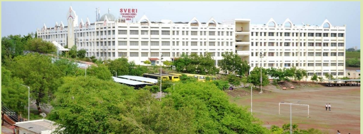
Drone View of Green SVERI

DON'T EVER THINK YOU CAN'T MAKE A DIFFERENCE, YOU CAN!