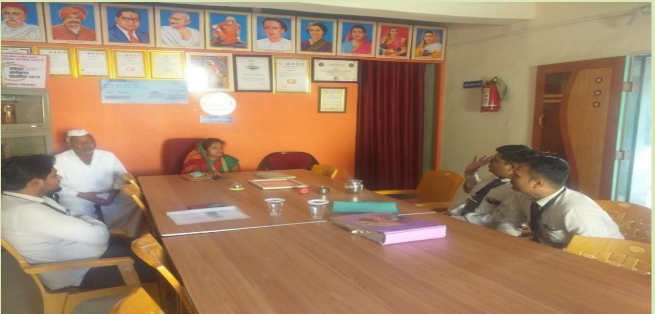
Faculty Visit at Tawashi Village

DON'T EVER THINK YOU CAN'T MAKE A DIFFERENCE, YOU CAN!